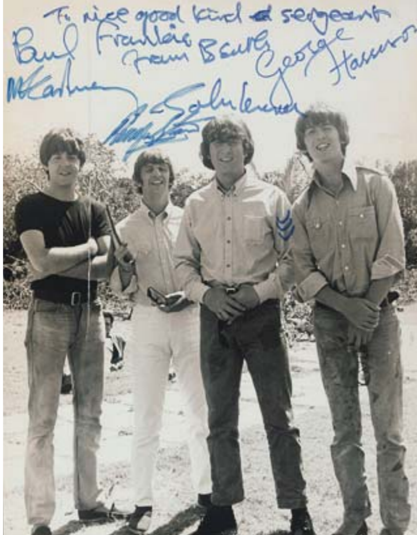
▲ Items connected with the Beatles sell well