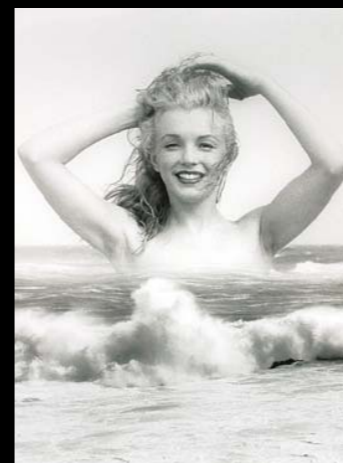
Early pictures of Marilyn Monroe fetch good prices